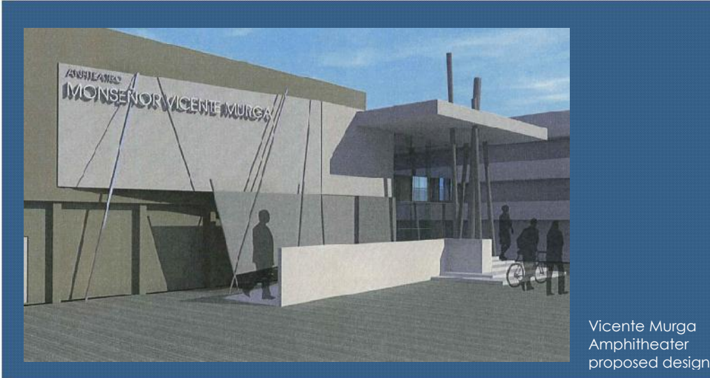
Vicente Murga Amphitheater proposed design.